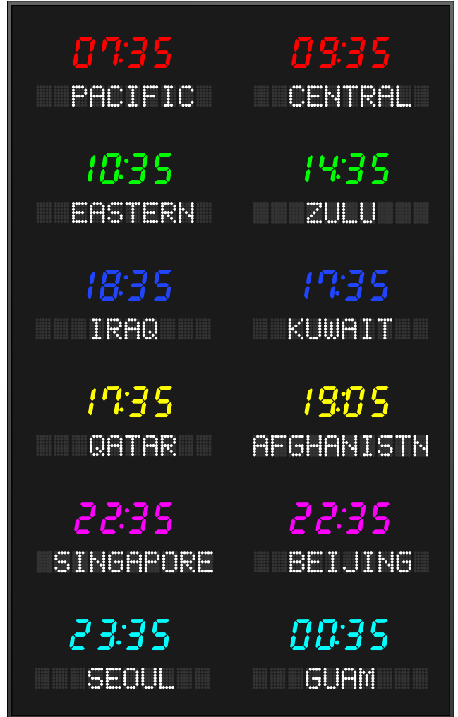
Model 6612AG - 1.8" time, 1.2" zone labels, 12 zones